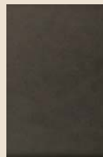
OB Oiled Bronze