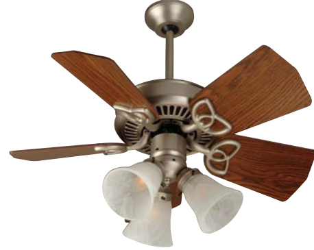
Brushed Nickel Piccolo with 29" Piccolo Dark Oak Blades and Fitter/Glass

Model-Finish M29W Blade-Finish B529S-W Light-Finish Not Shown