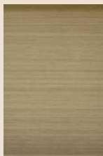
AB Antique Brass