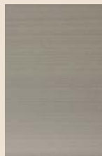
BN Brushed Nickel