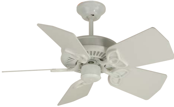
White Piccolo with 29" Piccolo White Blades

Model-Finish M29W Blade-Finish B529S-W Light-Finish Not Shown