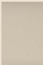
AW Antique White