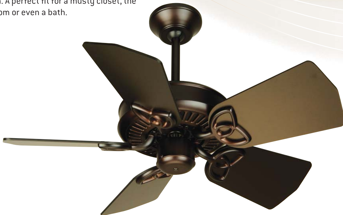
Oiled Bronze Piccolo with 29" Piccolo Oiled Bronze Blades

A small fan that moves a lot of air with its 25° blade pitch. A perfect fit for a musty closet, the laundry room or even a bath.