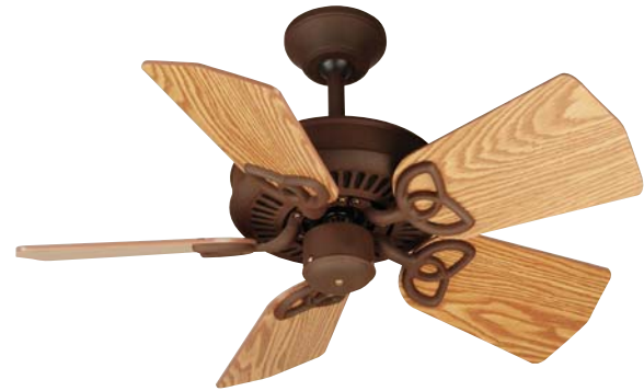
Rustic Iron Piccolo with 29" Piccolo Light Oak Blades

Model-Finish M29AB Blade-Finish B529S-LOK Light-Finish Not Shown