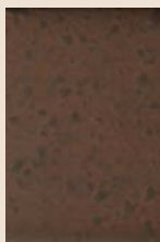
RI Rustic Iron