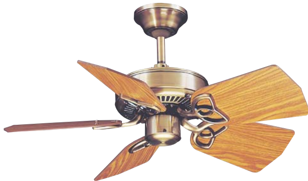
Antique Brass Piccolo with 29" Piccolo Light Oak Blades

Model-Finish M29BN Blade-Finish B529S-DOK Light-Finish F300BN/108