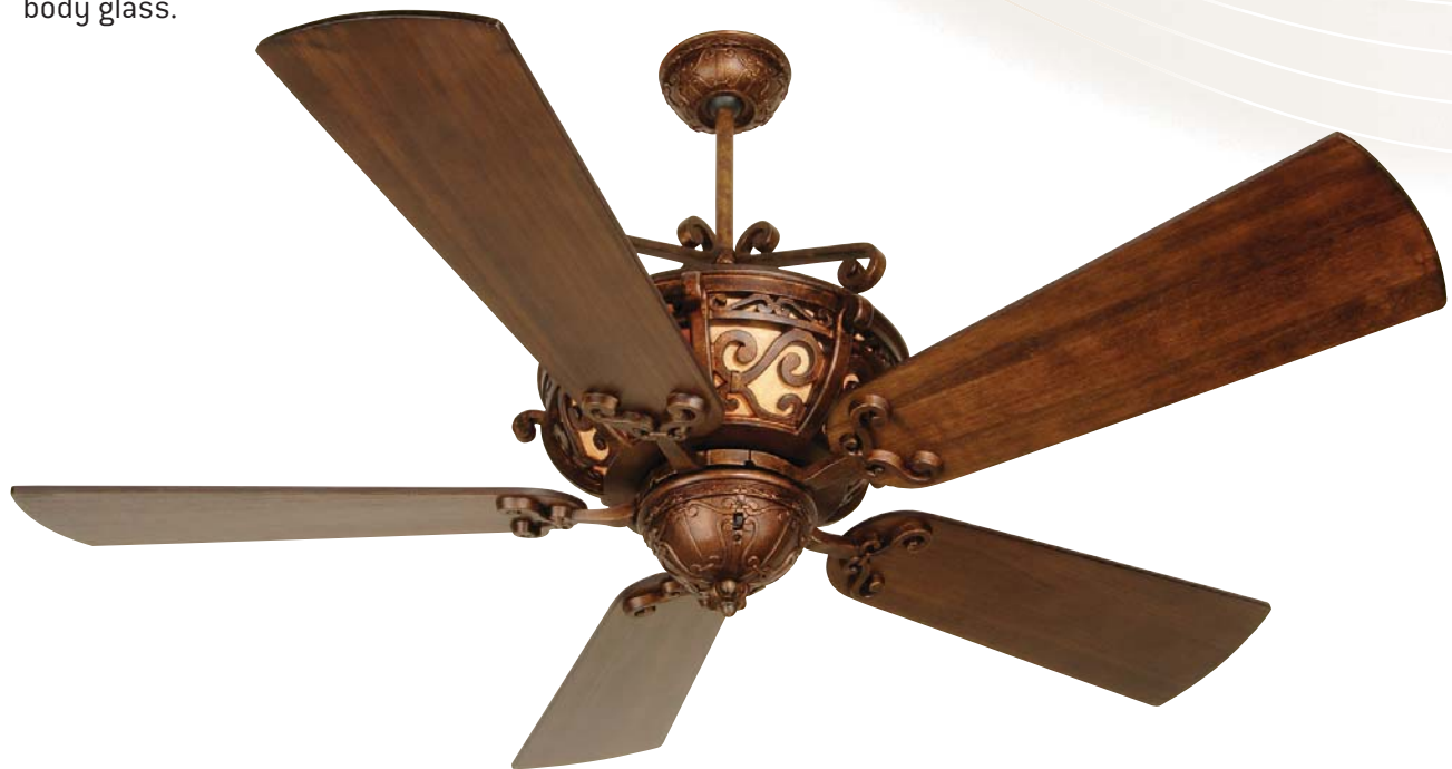
Peruvian Toscana with 54" Premier Hand-Scraped Walnut Blades

The Toscana fan features bold scrollwork enhanced by back-lit Antique Scavo body glass.