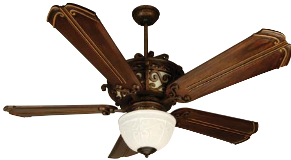
Peruvian Toscana with 56" Custom Carved Chamberlain Walnut Blades

Model-Finish T052PR Blade-Finish B556C-CH10 Light-Finish LK50-PR