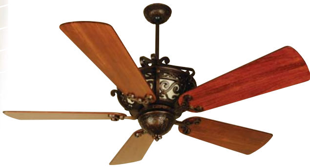
Peruvian Toscana with 54" Premier Hand-Scraped Cherry Blades

Model-Finish T052PR Blade-Finish B554P-CH9 Light-Finish Not Shown