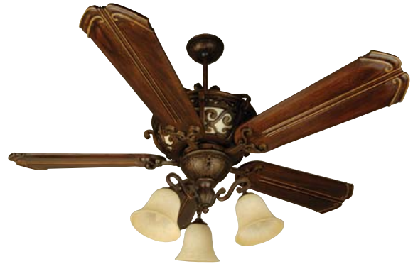
Peruvian Toscana with 56" Custom Carved Chamberlain Walnut Blades

Model-Finish T052PR Blade-Finish B554P-CH9 Light-Finish Not Shown