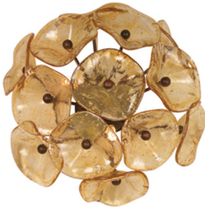
E22091-26 Cassini 3-Light Flush/Wall Mount